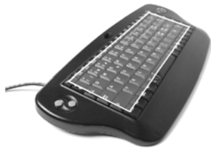
Figure 1. Touch&Type™ (1 st generation prototype); the mouse buttons are shown left; the touch sensitive area is framed.

FBZS Interface Technology, in collaboration with IHA/ZOA of ETH Zurich, has developed a keyboard with integrated pointing device called Touch&Type™, which is designed to overcome many of the drawbacks in pointing devices discussed above. It works like a conventional touch pad, whereby the touch sensitive area is formed by the surface of the keys themselves and thus can be as large as the key area (Fig. 1). As a consequence, the whole hand may be used to steer the cursor by gliding over the keys (not depressing them), as compared to a single finger in the touch pad's case. Due to the gaps between the keys, the keyboard's texture helps users to develop a feeling for the location and the speed of their hand.