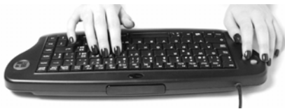
Figure 2. Pointing-mode: user's left hand activates pointing-mode by touching one of the mouse buttons, user's right hand steers the cursor by gliding over the keys.

In the version for right-handed users, pointing-mode is activated when the user's left hand touches one of the two mouse buttons (it does not need to be depressed), located on the left part of the keyboard (Fig. 2).