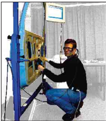
Figure 3: A hybrid AR-HMD and Touch-Panel-Display System was chosen for the AR-supported assembly. This hybrid system makes wearing a HMD during the entire assembly unnecessary. The Touch-Panel-Display shows the easier assembly steps such as those in an electronic manual, and it is fixed to the frame for the door assembly.

mation for users in the mobile environment, as well as for those in the advanced control room. An additional advantage is the automatic recording of on-site data, which helps to build the medical record of a patient without interfering with the work of the emergency team. The user-interface technology for which the authors propose investigation includes multimedia, AR information stickers, and the allocation of patient medical records to specific locations of the human body. These are novel and innovative uses of AR technology. The strength of this work lies in describing the application scenario. The authors show a strong expertise in developing outdoor AR interfaces and show how the prototyping of some elements required for the envisioned large-scale system occurred. Finally, this paper shows how outdoor collaborative AR can be embedded into a larger workflow system.