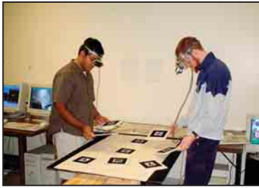
Figure 1: Collaboration with AR technology. The subjects wore a head-mounted display with a small video camera attached.

laboration, while others offer solid empirical work, presenting experimental studies with alternative applications. In reading some of the studies included in the IJHCI special issue, the reader will recognize that the topics of usability and collaboration are dealt with simultaneously.